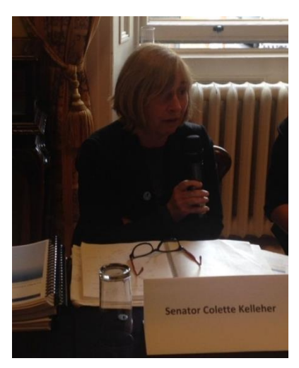
Senator Colette Kelleher