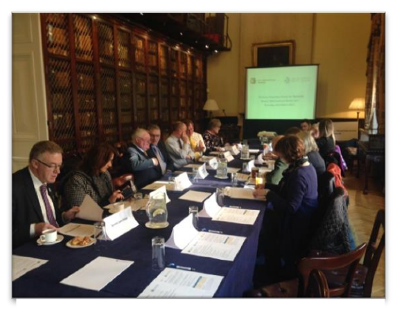
Speakers and attendees at the round table event on home care