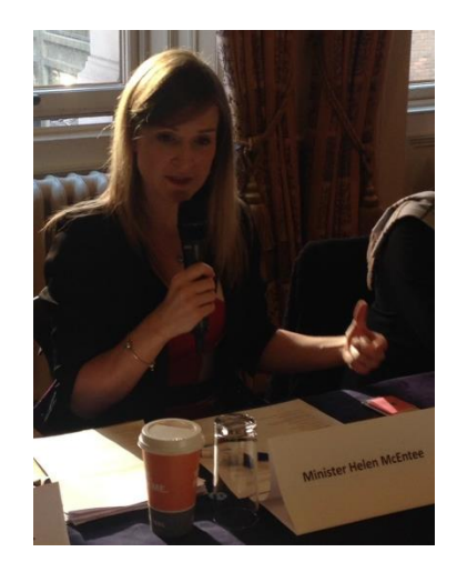
Minister Helen McEntee