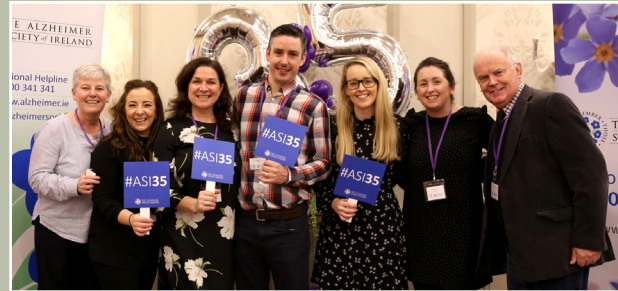
ASI Staff & Volunteers attendees