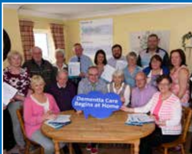
ASI staff and branch members with political representatives and families living with dementia in Glenties Day Care Centre 07 July 2017

More information on this campaign and our full reaction to Budget 2018 is available on the ASI website.