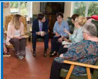
Minister Simon Harris with members of the ASI Wicklow Branch and staff in Lily of the Valley Day Care Centre 22 September 2017