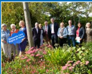
Members of the ASI Meath Branch with Minister Regina Doherty, Minister Damien English and other political representatives in Whistlemount Day Care Centre 25 September 2017