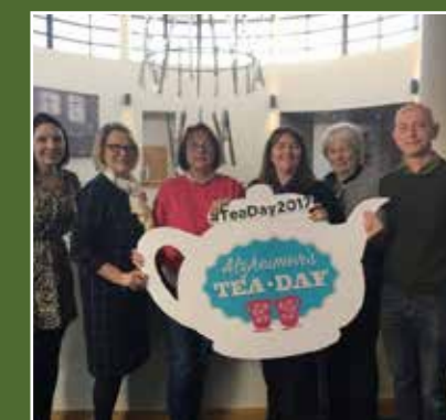
Members of the DCCN committee and IDWG steering group at their meeting on 8th April