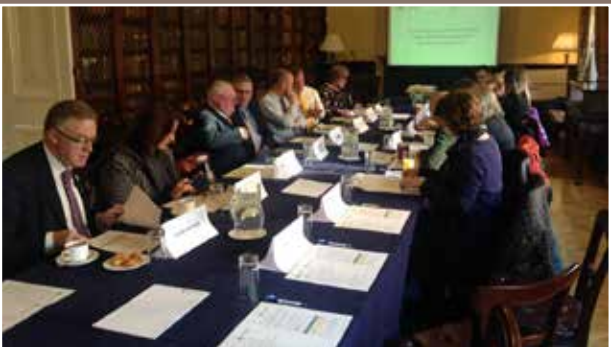
Speakers and attendees at the round table event.

The All-Party Group hosted a round-table event for key stakeholders on Thursday, March 23rd to advance the discussion on how Ireland can develop a scheme for home care that is equitable, well-resourced and well-regulated.