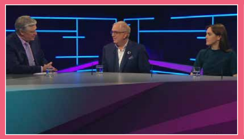
The Pat Kenny Show TV3

Ennis Day Care Centre was the backdrop for a wonderful piece highlighting the work of the ASI and will be aired on RTÉ's Winning Streak before Christmas. Keep an eye on our social media for the date.