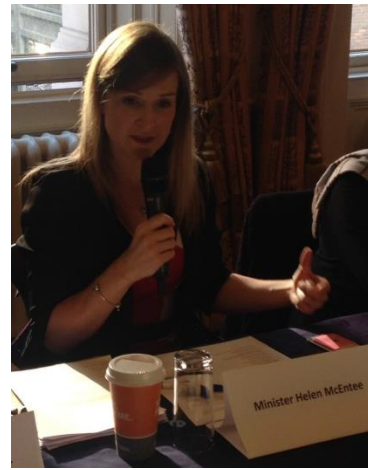
Minister Helen McEntee