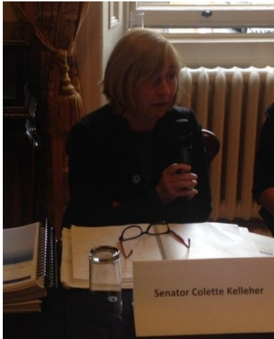
Senator Colette Kelleher