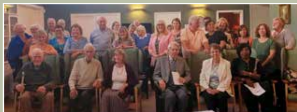
South Dublin AGM 18th June.

If you have any queries or would like to submit a piece for The Voice please email - thevoice@alzheimer.ie